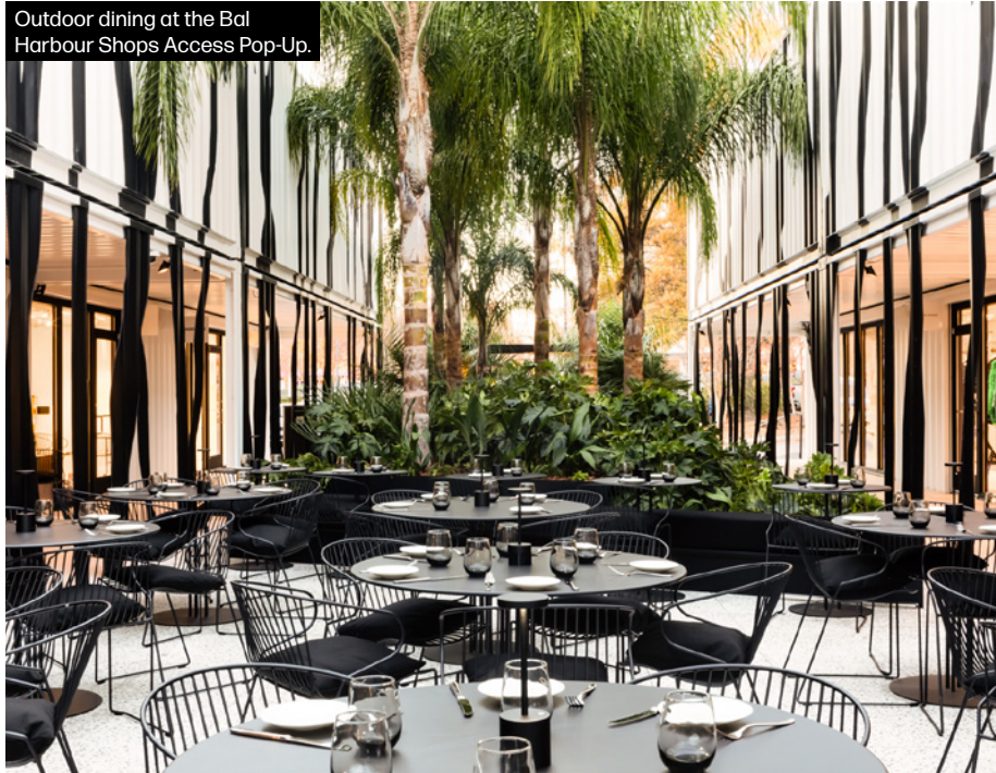
Outdoor dining at the Bal Harbour Shops Access Pop-Up.

Shops brand can be more prominent," Lazenby said.