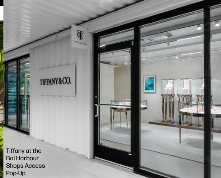
Tiffany at the Bal Harbour Shops Access Pop-Up.

The format, he said, is "fun. It's different," and it's hoped it leads to personal shoppers building relationships with local consumers, after the pop-up moves away.