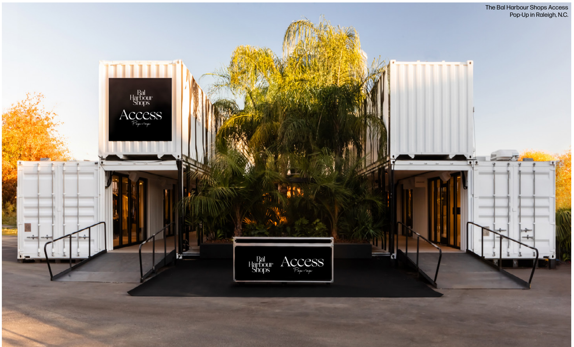
The Bal Harbour Shops Access Pop-Up in Raleigh, N.C.