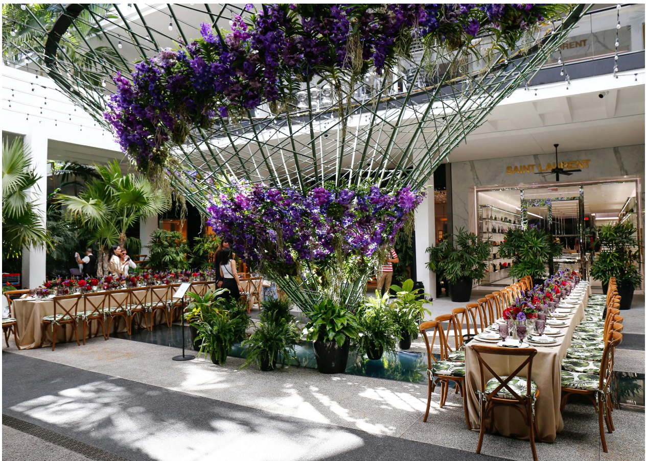
Bal Harbour Shops