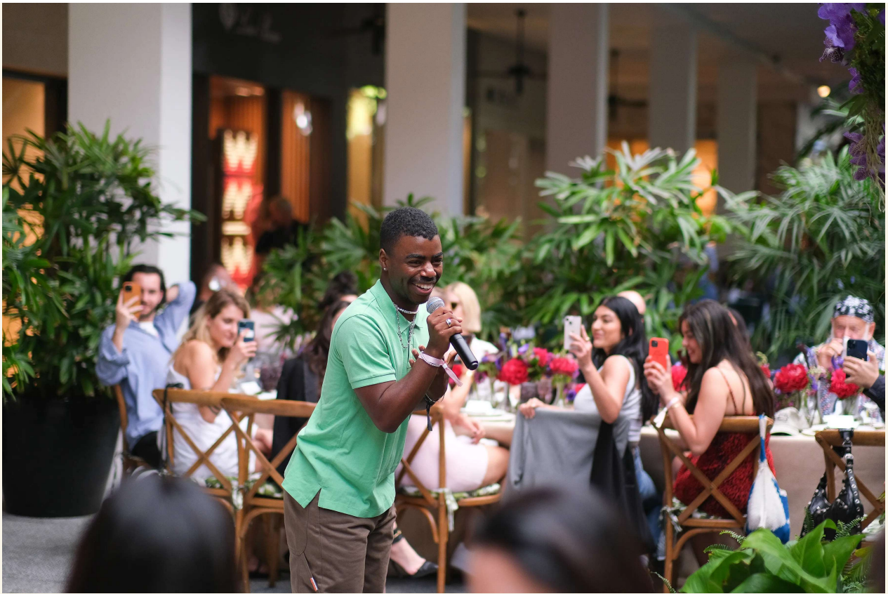
Tyrell Hampton